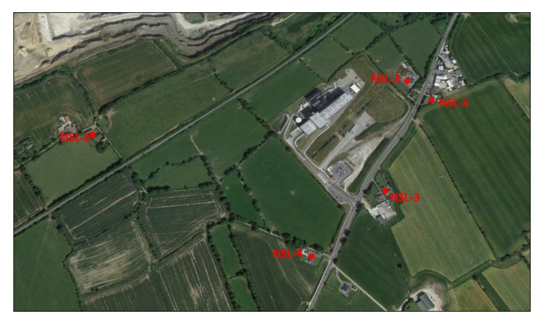
Table 10.14 presents the calculated noise levels at each of the assessment locations taking account of the operational noise sources associated with the proposed development and assumptions outlined in the previous sections. Results are calculated for the daytime (07:00 to 19:00hrs), evening (19:00 to 23:00hrs) and night-time period (23:00 to 07:00hrs).